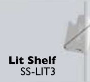
Lit Shelf SS-LIT3

The ExpoSpaceSaver SS-LIT3 is an angled, frosted plex shelf that attaches to ExpoSpaceSaver's hardware to provide literature space. The shelves are angled on the display and include a strap to ensure that literature stays in place. The shelf comes in two pieces that attach easily using star key wrench (provided). Shelves are shipped in a cardboard box.